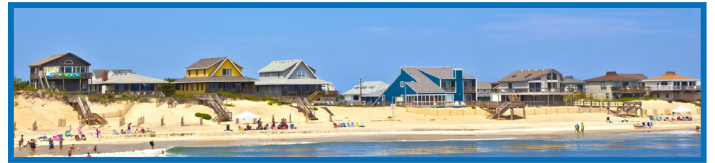
Vacation rentals are typically privately owned homes used for leisure purposes.

Arguably, the most commonly known type of short-term rental is a vacation rental: a privately owned home rented out to vacationers by the day, week, or month for leisure purposes. iii This rental industry has changed drastically in recent years with the explosion of the peer-to-peer model. It is becoming increasingly easy and popular to rent one's own primary residence out as a vacation rental, and many communities across the country are rising in opposition to the practice due to the nuisance that can sometimes accompany its participants who routinely self-manage as opposed to using professional management services.