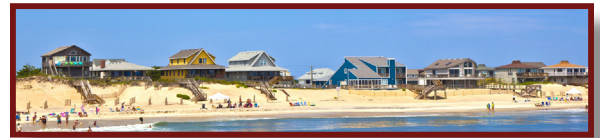
Vacation rentals are typically privately owned homes used for leisure purposes.

Arguably, the most commonly known type of short-term rental is a vacation rental: a privately owned home rented out to vacationers by the day, week, or month for leisure purposes. ii This rental industry has changed drastically in recent years with the explosion of the peer-to-peer model. It is becoming increasingly easy and popular to rent one's own primary residence out as a vacation rental, and many communities across the country are rising in opposition to the practice due to the nuisance that can sometimes accompany its participants who routinely self-manage as opposed to using professional management services.