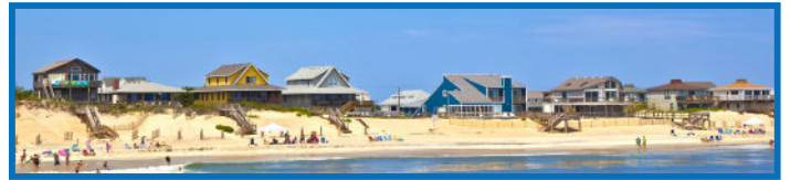
Vacation rentals are typically privately owned homes used for leisure purposes.

Arguably, the most commonly known type of short-term rental is a vacation rental: a privately owned home rented out to vacationers by the day, week, or month for leisure purposes. iii This rental industry has changed drastically in recent years with the explosion of the peer-to-peer model. It is becoming increasingly easy and popular to rent one's own primary residence out as a vacation rental, and many communities across the country are rising in opposition to the practice due to the nuisance that can sometimes accompany its participants who routinely self-manage as opposed to using professional management services.